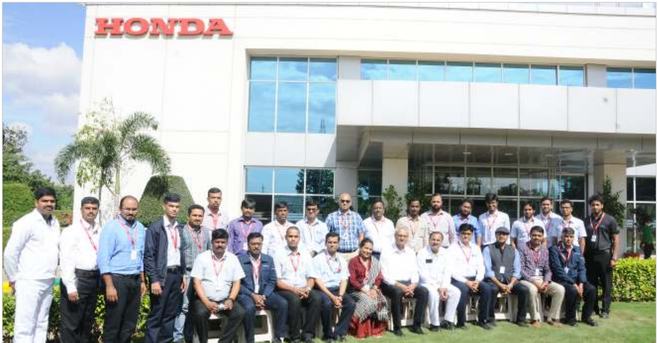
Delegates at the Honda Motorcycles & Scooter India Pvt. Ltd. Plant

Top executives of select manufacturing industries based out of Bangalore had the rare opportunity of visiting Honda Motorcycles & Scooter India Pvt. Ltd. and Volvo Trucks, the two world class manufacturing units located in Narsapura and Hoskote on the outskirts of Bangalore. Bangalore Chamber of Industry and Commerce (BCIC) hosted the industrial visit where participants were taken around the two facilities.