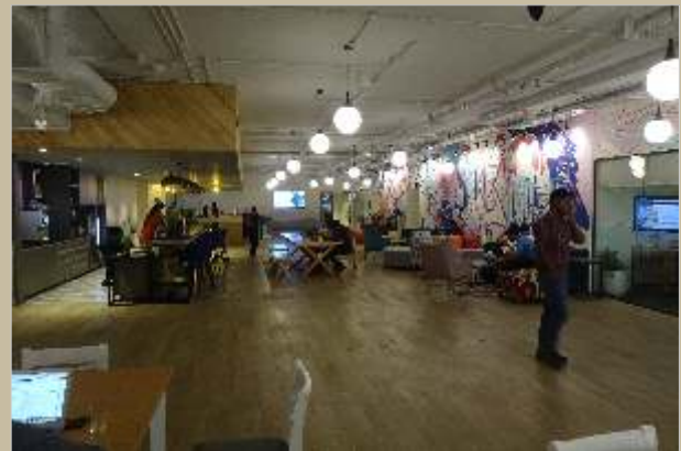
CoWrks Station: Promoting Innovation

is much required for a successful evolution of small, medium and large enterprises of the future. The objectives are: