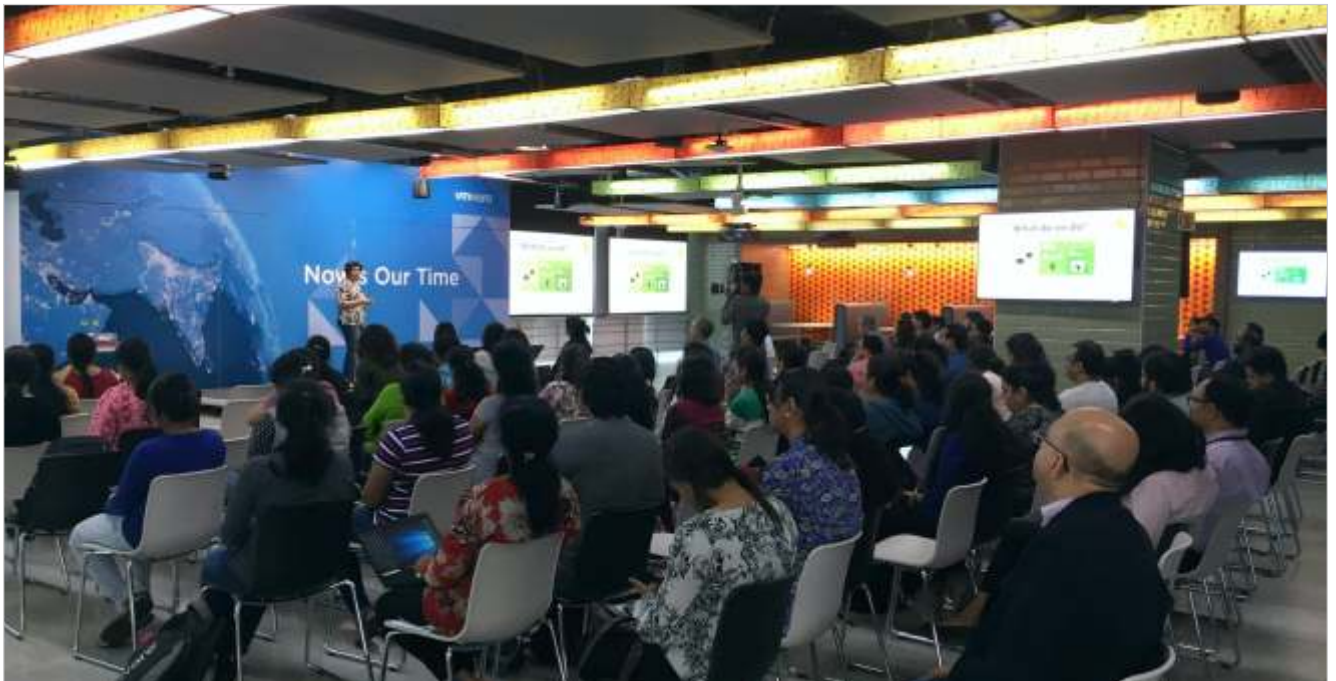
The AI session in progress

VMware Software India in collaboration with WomenWhoCode and Bangalore Chamber of Industry & Commerce (BCIC) hosted a Session on Artificial Intelligence in Bangalore.