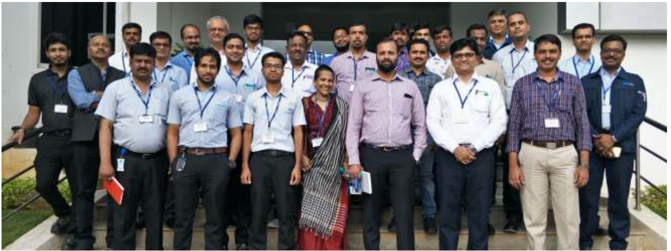
Delegates at the Volvo Trucks Plant