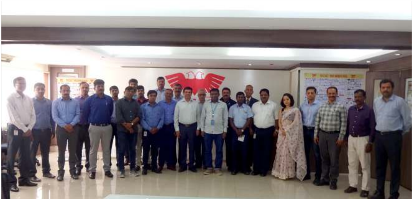
Participants at the interactive Session on Environment Day 2019

Bangalore Chamber of Industry and Commerce (BCIC) hosted an Interactive Session on "Environment Day 2019" under the aegis of its Energy, Environment and Water Expert Committee.